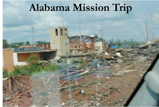
Alabama Mission Trip